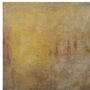
The Verse of Light by Taha Afshar, 2016 oil and mixed media on linen 110cm x 110cm x 3cm.

Further press information and high res jpeg images: Gail McGuffie PR Tel: +44 (0)7885 10 33 53 Email: MGailMcG@aol.com