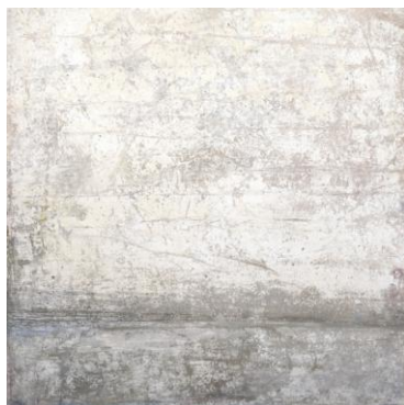
Go Polish the Tablet of your Heart by Taha Afshar, 2016, oil and mixed media on linen, 95cm x 95cm.

Works presented by Taha Afshar (b. 1983) explore ideas of illumination of the heart from reflection and contemplation of the divine, a central theme in Shabistari's Garden of Mystery. The abstract lake-scapes invite us to reflect over their watery surface, which intentionally glow from a central point – the sun – a metaphor for the divine essence. The set of works explore the notion of the light within the human heart and soul. The landscape as a backdrop is a metaphor; these are internal landscapes. The gold leaf and mirror in these works all serve symbolic purposes of the alchemical process of prayer and reflection. Shabistari writes: "Go polish the tablet of your heart, so that an angel will dwell near you." http://www.tahaafshar.com/