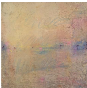
Forever Illuminate the Eyes of all Hearts by Taha Afshar from Letting Light In series, 2016, oil and mixed media on linen, 65cm x 65cm. Photo: Paul Pescoe